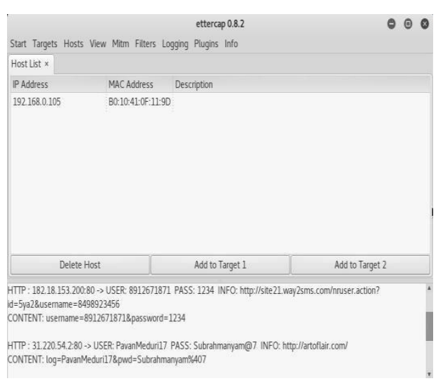
Fig. 2: In This Way, the Packets are Being Sniffed to the Host Machine.