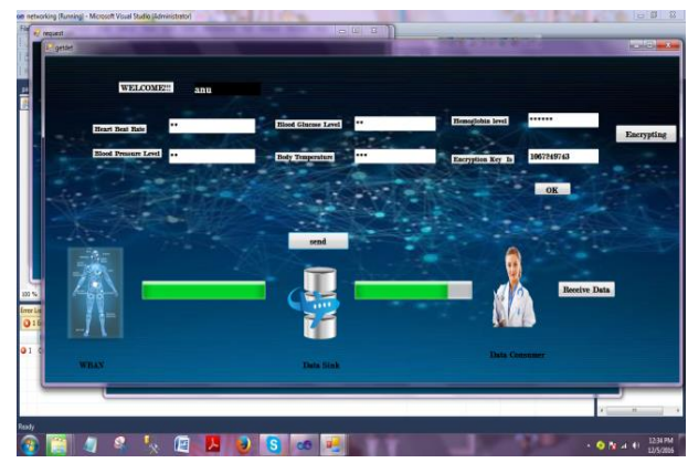
Fig. 4.1: WBAN.

A BAN comprises of remote sensors called BAN gadgets either installed on/close to the surface (i.e., wearable gadgets) or embedded in the profound tissue (i.e., embedded gadgets) of a human body. These sensors are misused to screen fundamental body parameters or body developments (e.g., endoscopy cases and movement sensors), and additionally control the human body by giving life bolster, visual/sound criticism, and so on. A BAN can be utilized by its human conveyor for an assortment of utilizations, including medicinal services, military battle bolster, and athletic preparing, just to give some examples.