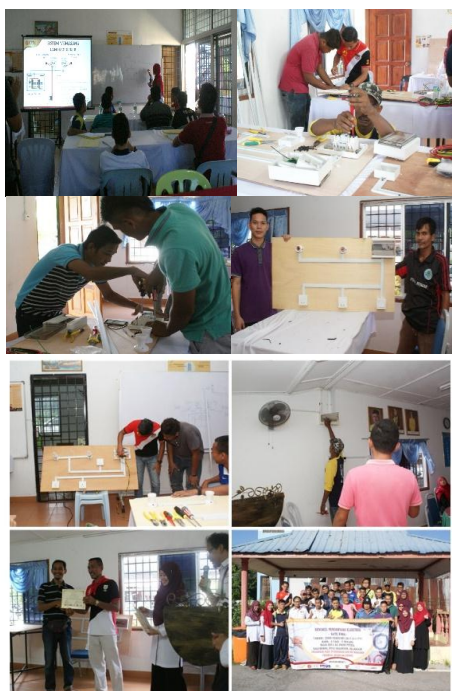
Fig. 1: Activities of youths during the electrical wiring workshop.

The location of the study was in the countryside in Kampung Serting Ulu, Kalumpang, Hulu Selangor. Respondents involved in this study comprised youths from various backgrounds which considering their education, employment and family institutions in each selected study location. In addition, the census approach has been used 21 respondents were involved in this study. The study uses a 'Thurstone Scale' for skills assessment purposes. Assessment was measured by two aspects, which first is the level of respondent's skill level and second was the assessment of the effectiveness level of the workshop. The respondents' profiles and comments have been reviewed and considered. Fig 1 shows some activities conducted during the workshop.