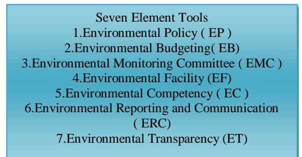
Figure 1.1: EMT TOOLS

Environment Mainstream Tools (EMT) has seven elements to measure the compliance of manufacturing workplace towards the green environment as (figure 1.1). This tools is connected to OSH practices towards green environmental, example a clean production (CP) will created a health and healthy environment, it will contributed to good productivity and effenciency. A clean production such as proper manage schedule waste through re-use, recylecling, storage, and inventory by using Electronic schedule waste inventory management system( Eswim), will created a healthy environment to employees and motivate them. Cleaner Production (CP) was known as a preferred strategy for achieving an efficient use of natural resources and pollution prevention. In this condition employers need a information and knowledge in green environment through agency such 'MY HIJAU' or Perbandanan Teknology Hijau Melaka; CP can be well-defined as the use of key concepts in the overall prevention, eco-efficiency, environmental strategies, full life cycle and etc.