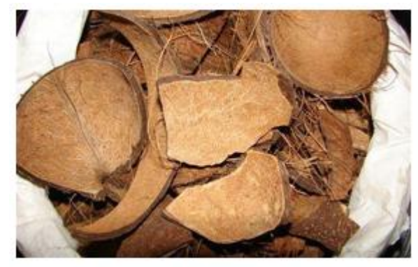
Fig. 6: Coconut shells were collected and dried completely for the preparation of activated carbon.