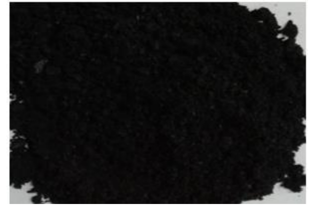
Fig. 8: Crushed carbon grinded completely to develop into activated carbon.