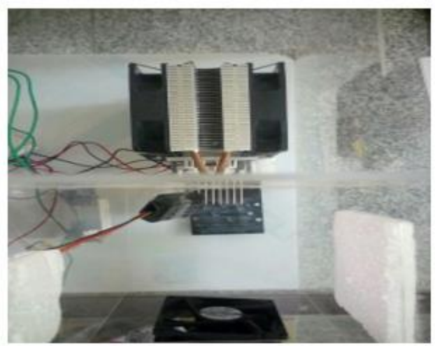
Fig. 5: Hydrophobic surface containing model for water extraction Activated carbon preparation and results for purification process: