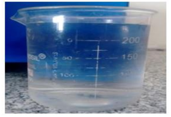
Fig. 4: gathered water from the model