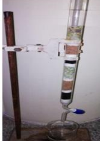
Fig 10: Purification column

Gravels sand activated carbon gravels sand activated carbon