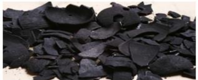
Fig. 7: Dried shells was burnt under high flame to become crushed carbon.