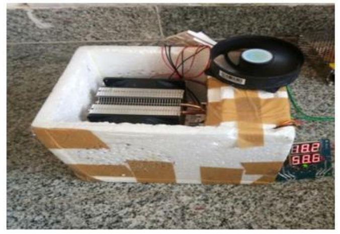
Fig. 3: Prepared plan for water production