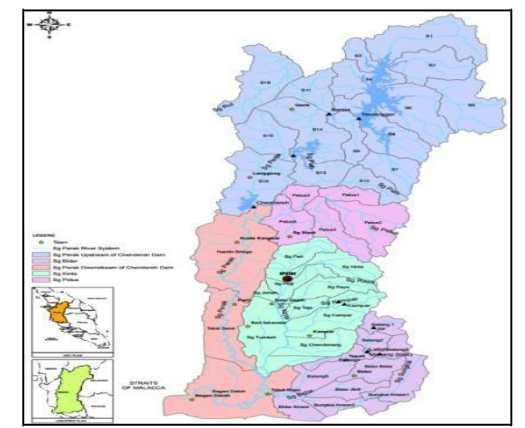
Fig. 1: Sg Perak Basin Catchment Delineation for Rainfall-Runoff Model (source: G&P, 2010).

Sg. Perak River is the main river in Perak which covers a catchment area of 3504 km<sup>2</sup> and river length approximately 400 km, flowing from Hulu Sg. Perak at upper of Temengor catchment through Bagan Datoh until Strait of Malacca. Sg. Perak is the second largest river in Peninsular Malaysia after Sg. Pahang. Figure 1 shows the overall catchment of Sungai Perak river basin. The annual rainfall is in the range of 2400 mm to 3200 mm at the northeast part of the basin, particularly in the upper Temenggor Dam catchment. At the south-eastern part of the basin, the annual rainfall increases between 2,600 mm and 3,400 mm. The average annual rainfall for the whole basin is about 2,300 mm. (IRBM, 2010) Figure 1 shows the Sg Perak Basin Catchment Delineation for Rainfall-Runoff Model.