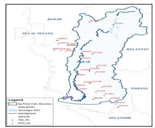
Fig. 2: Location of available streamflow stations located in the State of Perak.

By reviewing the stream flow data collection in Sg. Perak Hydroelectric Scheme, a decision regarding the selection of appropriate and suitable rainfall stations that can be used for this study was done. The available longest records data should be at least up to 10 years. Table 1 shows the selected streamflow stations in this study and figure 3 shows the Analysis Technique on Flood Frequency Analysis using Log-Pearson Type III Distribution. For DID station, the stream flow recording stations available in the study from the year open up to the year 2016. There were two (2) TNB's stream flow recording stations available in the study area. However, both stations were closed in the year 1982 and 1996.