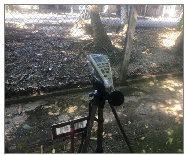
Fig2: Continuous Noise Monitoring Set up

The continuous monitoring is done for 24-hours continuous period where the data is taken in 15 minutes sampling time at both test locations [1]. The setup of the measurement equipment is shown in Figure 2.