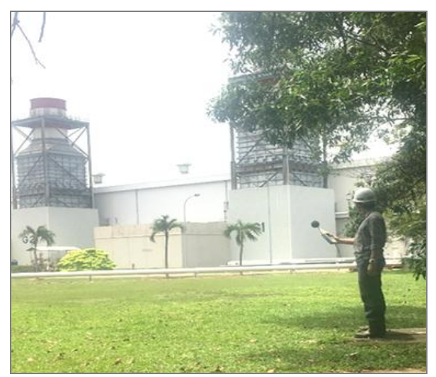
Fig 3: In-situ Noise Measurement Setup

The data is taken during the schedule period at both locations of measurement during day time and night time in 15 second sampling time according to the test condition and load distribution [1], as shown in Figure 3.