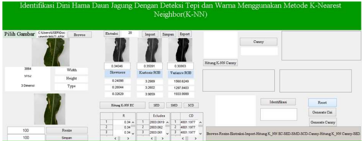
Figure 3: Color extraction

The image extraction stage consists of two features: color and edge. The value of K-NN color with a value of K of 20. This value is obtained based on experiments on several values of K. Figure 3 and 4 show the process of color and edge extraction