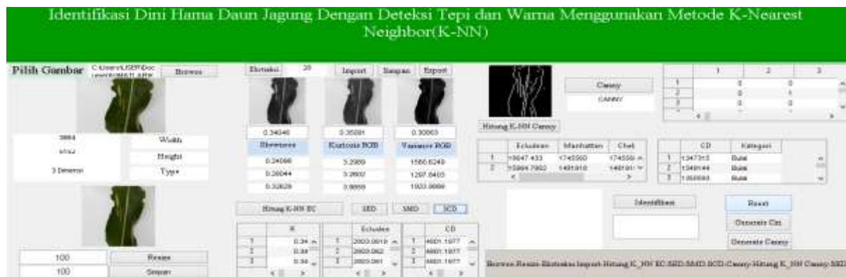
Figure 4: Canny Edge Detection