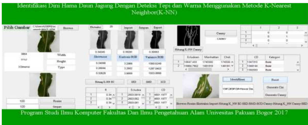
Figure 5: Identification system

with the closest distance between the KNN color and the edge KNN. This comparison will be a comparison parameter between pests with each other ( Figure 5).