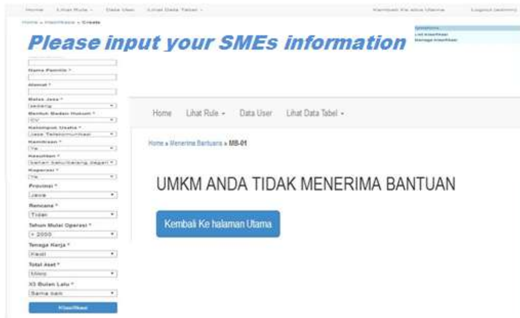
Fig. 3: The interface of decision support system for Indonesian telematics services SMEs