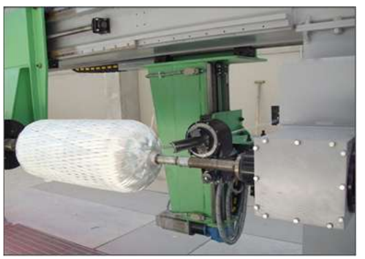
Fig. 2 Filament winding technique

Steel Cylinders are not manufactured in a single joint but are welded. While composite cylinders are manufactured in a single joint, Composite components cannot be welded like the steel cylinder. Composite Cylinders are winded using Filament Winding technique as shown in Fig. 2.