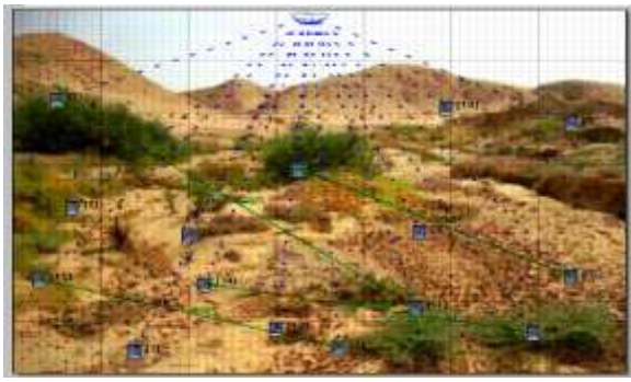
Figure 2: Scenario created in QualNet 3D view

Figure 2 shows the scenario created in QualNet 3D view.