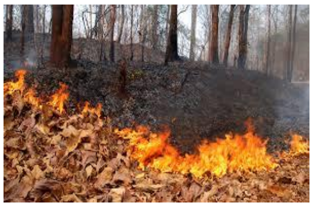
(b) Surface Fire