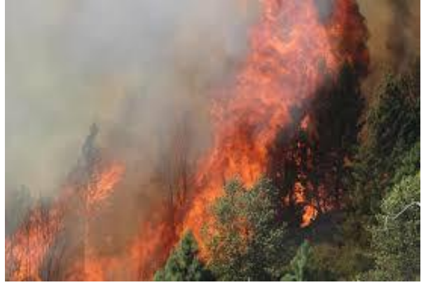
(c) Crown Fire Fig. 1: Types of Forest Fire

Fig. 1a represents ground fire where the fire ignition happens below the ground and only smoke will be visible above the ground without any flames.