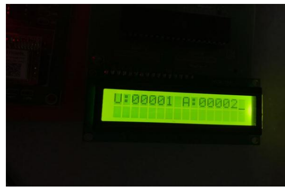
Figure 5:-Amount and Units Consumed

This is our structure were smart power meter is related with the little scale controller one side and afterward again it is related with the essential supply. Here in the controller we form a code for recuperating the data from the smart power meter. From little scale controller we interface it to ADC which changes over basic data to the propelled data and negative behavior pattern versa, from here the data is given to the MAX 232 and RS232 which are used as interfacing unit between smart power meter and the GSM network [6]. RS232 is a connector which is used to transmit the electric signs between the system and modem. As per the code written in the littler scale controller, SMS is sent to the smart power Provider Company. At whatever point SMS is sent to the smart power Provider Company then customer is given a prepared alert which moreover reminds customer about the charge. This is for the customer flexibility here we too give LCD Display. This helps the customer for affirming the data when SMS is sent to the smart power Supplier Company. This decreases bungles done by the masters in the midst of taking the smart power meter perusing.