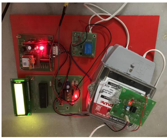
Figure 1: - Experimental setup for proposed design