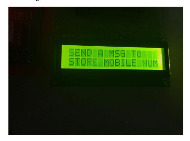
Figure 3:- Send a message to Registered Mobile