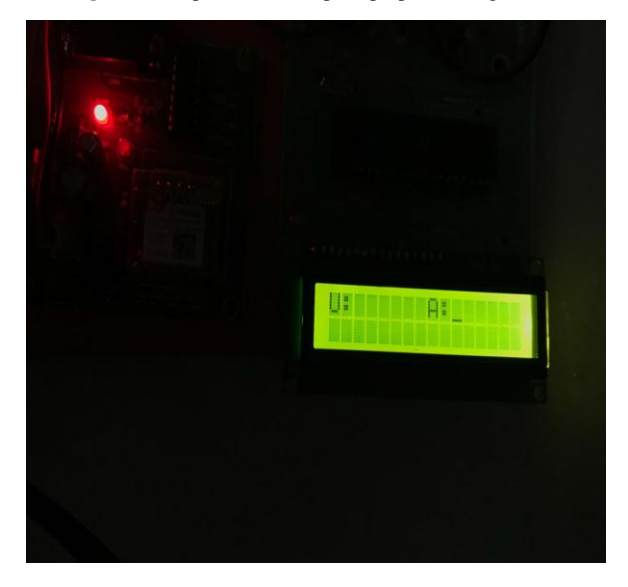
Figure 2 :- Indicates U:Units and A:Amount