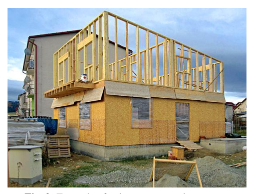
Fig. 2: Example of column construction system