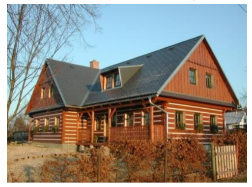
Fig. 1: Example of log construction