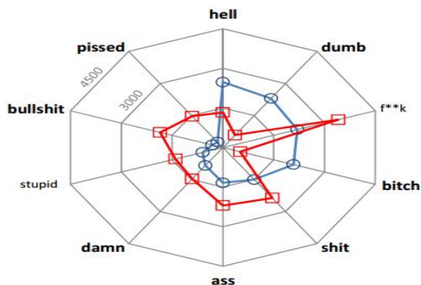
Fig. 2: Top Ten Frequently Used Foul Words According to Gender [7].

The current study only targeted the usage of pronoun and vocabulary usage differences. This is done in order to prove the assumption in which the accuracy of classification in terms of harassing contents can be enhanced through the use of gender-specific features. The current study is also characterized by the use of foul words in 100,000 posts that were randomly selected the dataset and compared the foul words used in a frequent basis by each gender. According to the results of Wilcoxon signed rank test, it is found that there is a significant difference between males and females in terms of the frequency in using the foul words in their posts fig 2 illustrates Top ten frequently used foul words by female (circle) versus male (square).