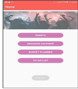
Fig. 5: Home screen

In this above Login page screen we have two edit texts and the Login button[8]. Here the edit texts are the user name and the other is the password boxes to enter the credentials in it to get login and the Login button is here to get login when clicked and moves to the home screen[9].