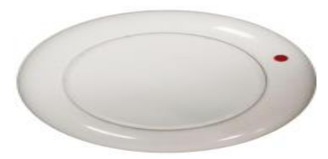
Fig. 9: Panic Button.

If this button is checked, automatically it will alert the receiver side from the front side