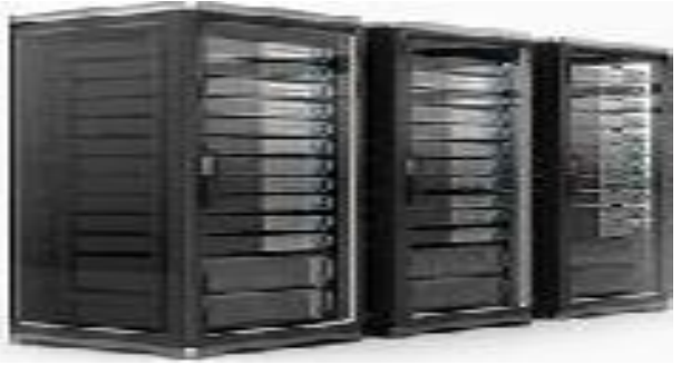
Fig. 4: Servers.

These servers receive and store the data sequentially from the user for the review of receiver end.