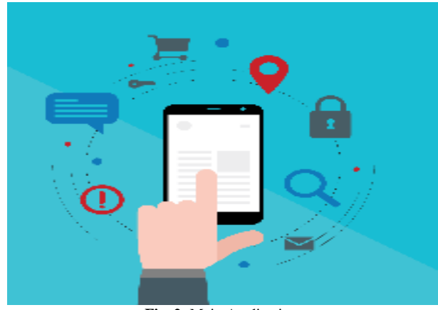
Fig. 2: Main Application.

This application sort out the location values of GPS and helps to send message and call through GSM.