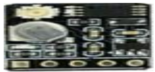
Fig. 7: GPS.