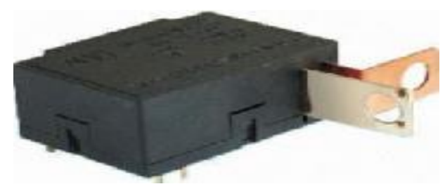
Fig. 6: Magnet and Relay.

These magnet & relay are pasted to the door to sense the stranger who tries to open the door. In case anyone opens the door automatically the alert will be send to house owner mobile number as message.