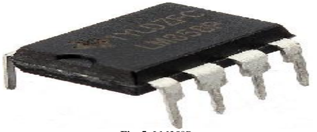
Fig. 5: LM358P.

This sensor is used to sense the vehicle location and also prevent the vehicle from theft.