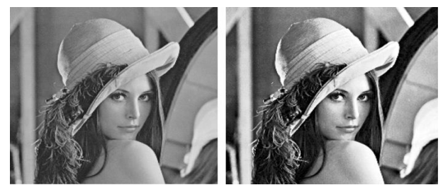
Fig. 2: Enhancement Results A) Original Image B) Enhanced Image.

Contrast Enhancement aims at enhancing the global or local contrast of an image. Some of the enhancement techniques include histogram equalization, Genetic algorithms and fuzzy set algorithms. Many modifications are done in the standard methods to improve the contrast of the images.