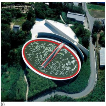
Fig. 3 a): Placement of water reservoirs on a horizontal plane — swimming pool "bridge". Sky Habitat project, Singapore, architect Moshe Safdie. Source: [14]; b) "water mirror + entrance" technique. Water Temple, Japan, architect Tadao Ando. Source: [15]

but in general is more idealistic. Tadao Ando represents the above-mentioned situation in his project the Water Temple. He uses this idea to emphasize the transition from an ordinary daily life to a special atmosphere of a Buddhist temple (e.g. Figure 3 b). In general, Tadao Ando's projects tend to be idealistic, metaphorical, environmentally friendly and full of natural components.