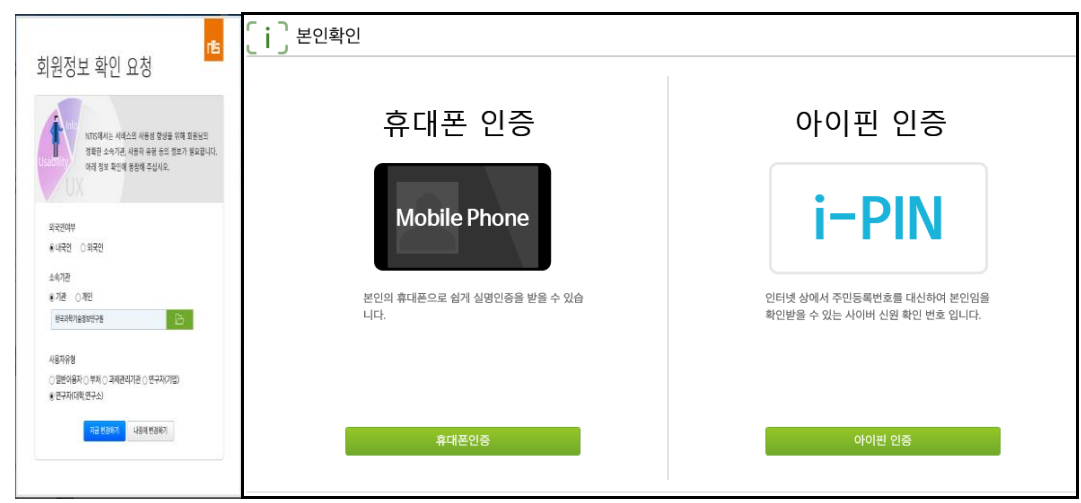
Fig. 4: Identity Verification for Providing National R & D Information

When raw national R&D information is provided through the R&D open services, user authentication is performed through PKI. Unlike search result download and NTIS cloud, the target of the opening of raw information through the R&D open services was limited to public organizations. Therefore, the GPKI was used.