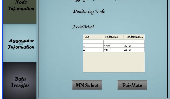
Fig. 2.b: Selection of monitoring nodes