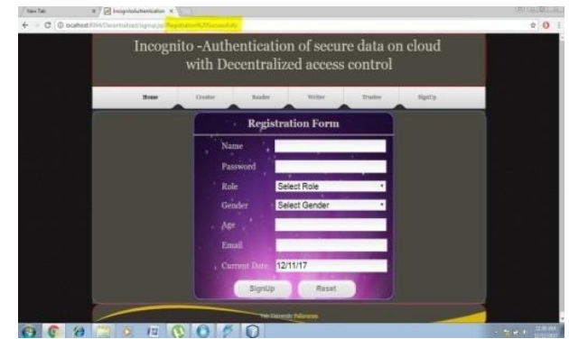
Fig. 2: Registration page

In this page the user will give his basic details like name, role, gender, E-mail, etc.