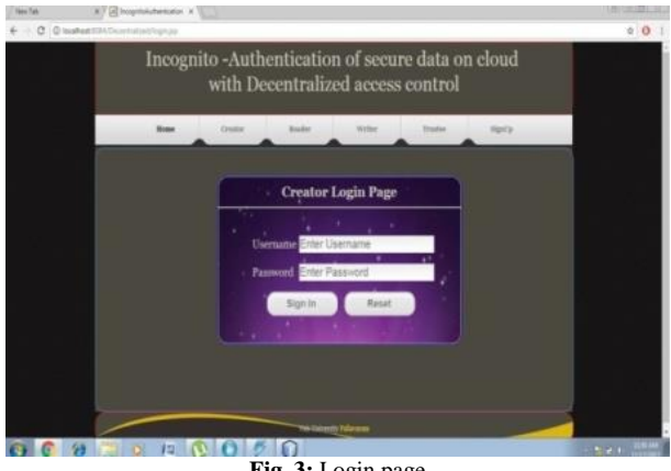
Fig. 3: Login page

In this step the user will enter his username and password for login and navigate to welcome page.