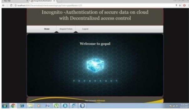
Fig. 4: Welcome page