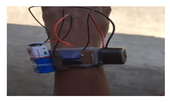
Fig.3.Schematic outcome of radiation detector

The circuit has built on a piece of breadboard and stitched in the wearable band and the photodiode has been enclosed with a black strap of rubber material to prevent light entering the sensor [9]. Then the circuit is covered and wrapped in aluminium foil and last it is grounded. It also does the role of electrical screening. The foil may cause short circuit to avoid it we just used the insulation tape[10].