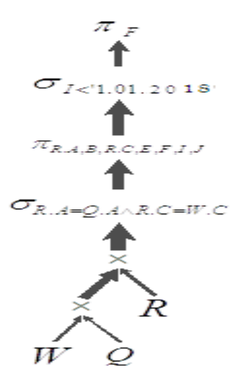
Fig. 2: Initial Relational Expression.

The disadvantage of this relational expression is the large expenditure of computational resources for its implementation. The graphical representation of the described relational expression is shown in figure 1.