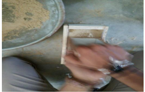
Fig. 4: Hand Moulding Process.

A strike is a piece of wood or metal with a sharp edge. Now CO_{2} is pumped into the mould and bonds with the silica sand to make a solid brick- like material in less than a minute and it is given in the figure 5. The bricks were taken out from the moulds. The next step is to infuse the bricks with a binder such as epoxy or urethane and it is shown in figure 6. Bathing the blocks in the binder creates a hardened block that has all the proper requirements for a strong building component.