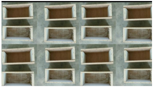
Fig. 2: Mould.

After collecting all the materials, a mould was prepared by the dimensions of 220 \times 100 \times 75 mm as shown in figure 2. The inner sides of the moulds were to be kept smooth without any friction.