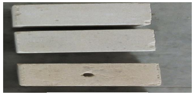
Fig. 6: Coated with Binding Material.