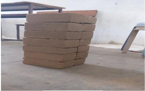
Fig. 10: Shape and Size Test.

In this test, a brick is closely inspected as shown in figure 10. It should be of standard size and its shape should be truly rectangular with sharp edges.