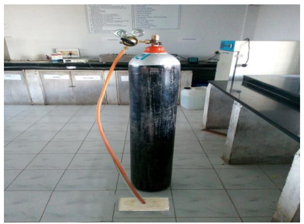
Fig. 5: Passing of CO2 in Brick Mould.

A strike is a piece of wood or metal with a sharp edge. Now CO_{2} is pumped into the mould and bonds with the silica sand to make a solid brick- like material in less than a minute and it is given in the figure 5. The bricks were taken out from the moulds. The next step is to infuse the bricks with a binder such as epoxy or urethane and it is shown in figure 6. Bathing the blocks in the binder creates a hardened block that has all the proper requirements for a strong building component.