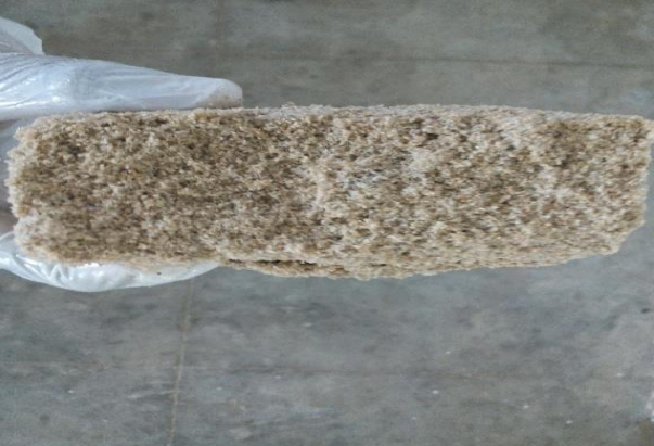
Fig. 12:Structure Test.

The finished bricks can also be more easily transported from where they are locally produce to the building site, and thanks to their tensile strength, they can create walls that require little or no added steel reinforcement. The product also has the promise of being a valuable way to sequester carbon.