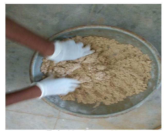
Fig. 3: Mixing of Raw Materials.

To provide friction free inner sides to the moulds, the inner sides are made with mica so that the moulds can be removed easily after casting with bricks. The required quantities of silica sand and sodium silicate are mixed thoroughly by kneading until the mass attained a uniform consistency and it was given in figure 3.