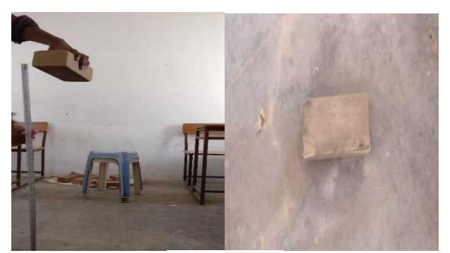
Fig. 9:Impact Test.