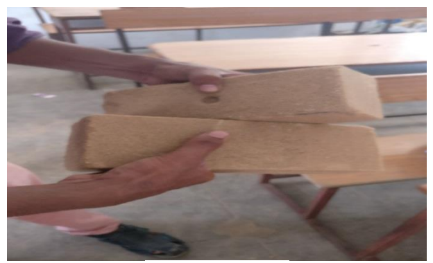
Fig. 11:Soundness Test.

In this test, the two bricks are taken and they are struck with each other as given in figure 11. The bricks should not break and a clear ringing sound should be produced.