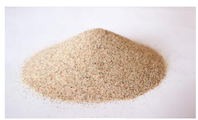
Fig. 1: Silica Sand.

Silicon-Oxygen (Tetrahedra) with each oxygen being shared between two tetrahedral giving an overall chemical formula of SiO_2 . The composition of sand varies, depending on the local rock sources and conditions, but the most common constituent of sand in inland continental settings and non-tropical coastal settings is silica(silicon dioxide, or SiO_2 ), usually in the form of quartz. Silica( SiO_2 ) sand is the sand found on a beach and is also the most commonly used sand. It is made by either crushing sandstone or taken from natural occurring locations, such as beaches and river beds and the picture as well as physical properties of silica sand shown as in below as figure 1 and table 1