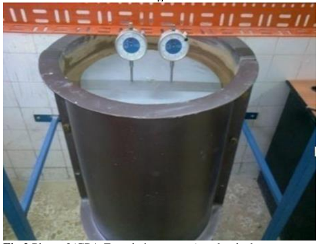
Fig.2 Plate of (GPA-Foundation system) under the heave

Field behavior of granular anchor pile anchors in expansive soils (1,2) in situ tests performed and emphasized that the rate of development of final heave increased and reinforcing the expansive clay beds with this granular anchor pile increases the uplift load with increases length to diameter ratio. The granular pile anchor under the effect a group of five GPA resulted in increased uplift load in comparison of that of the single pile anchor. Based the field study of granular anchor pile foundation in expansive soils observed that heave of expansive clays can be reduced and load carrying capacity of these soil increases, because of frictional force due to shear resistance on the cylindrical surface of the granular pile.