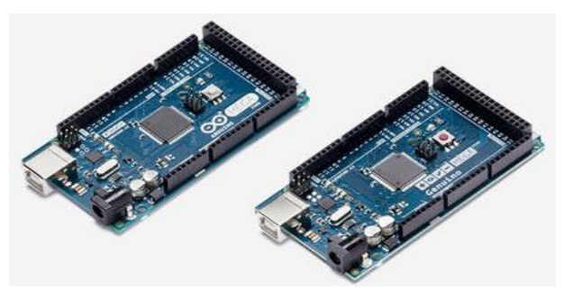
Fig. 4: Arduino MEGA 2560.

mance of Atmega2560 and Atmega328 is same due to operating in 16MHz both and difference is additional functions. [Figure 4].