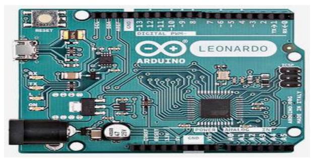
Fig. 2: Arduino LEONARDO.

Arduino Micro is used Atmega32u4 same as Leonards but big difference is small in size. It is difficult for Arduino UNO and Leonards with the size of a man's palm to make smaller size. [Figure 3].