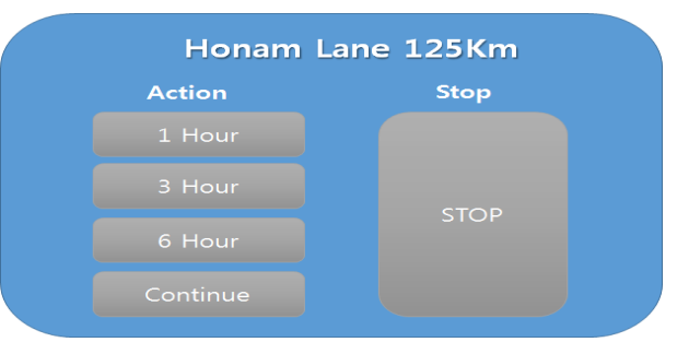
Fig. 7: Screen of Internet Control.

Fifty laser beamsin guard rail on road verge is installed in every 20m within 1Km and is connected control box to operate. Control picture through internet is shown in Figure7. Information of installed location is designed to operate in a variety of time for 1hour, 3hour, 6hour, and continuous hour. [Figure 7].