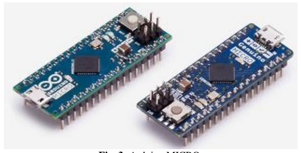
Fig. 3: Arduino MICRO.

Arduino Micro is used Atmega32u4 same as Leonards but big difference is small in size. It is difficult for Arduino UNO and Leonards with the size of a man's palm to make smaller size. [Figure 3].