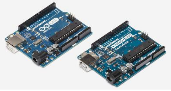
Fig. 1: Arduino UNO.

Main function and performance of Arduino is decided according to main chip applied. Board performance adaptive forproject is selected according to operating voltage, required number of pins, board size, price, upload method, communication support, and wireless communication with and without function.<sup>7</sup> Arduino UNO which is popular model for first-timer is widely used. Arduino Leonards has a same performance like UNO but the difference is no converter with USB to SERIAL. In order to upload programing information in sketch, Arduino UNO is to follow converter with USB to SERIAL for inputting data into Atmega 328. Therefore, most of Arduino board is used in converter with USB to SERIAL. But Leonards is used Atmega32u4 instead of using Atmega328. Atmega32u4 built in USB controller do not need extra converter with USB to SERIAL. [Figure 1, Figure 2].