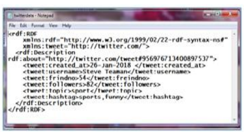
Fig. 3: RDF file

JENA API had used to create and manipulate RDF data model, so the extracted entities and their values from previous step considered as the properties (predicates) and its values as objects of the resource (subject) that represented by Tweet. Then the model saved in (.rdf) file as in Figure 3.