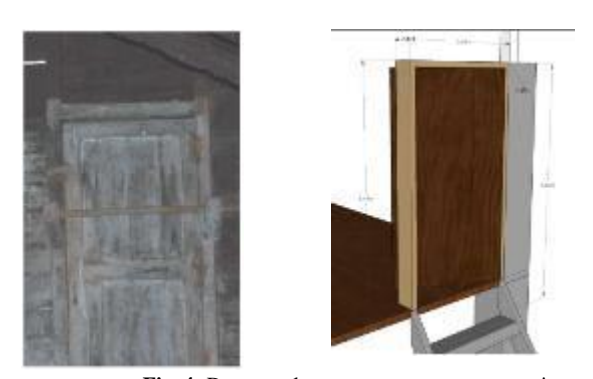
Fig. 4: Door typology as an entry access opening

In this traditional house, entrance access is located in two building areas, namely in the front and rear areas. The door on the entrance area has a terrace. Whereas the entrance access from the back door is directly connected to the stair access. At the front of the door lies the right and left side of the terrace area, followed by two window openings, as seen in Fig. 5. The shape of the door with one type of door made of madeng wood material.