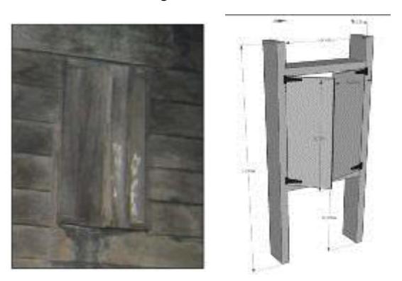
Fig. 5: Window view that does not have a grid for ventilation

The shape of this traditional house door, the shape of the outside and inside is the same as the other conventional house doors which are rectangular, but the door shape of the Gayo traditional house is composed of 3 to 4 wooden boards from the Medang tree arranged vertically. The high size of a doors from the floor is 1.49m, while if from the top of the stairs is 1.66m with a thickness of 6cm x 15cm with a width of 89cm. Between door one and the other has a measuring difference of 1 centimeter to 3 centimeters, Fig.4 .