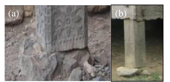
Fig. 2:(a). The umpak foundation system; (b) Foundation view

With the form of a wooden beam column that continues the vertical force against the pedestal foundation that comes from natural stone, so that it can withstand the main burden of the entire physical structure. The shape of the stone is the foundation of the Umpak in the form of haphazard, but meets the criteria as a barrier to the establishment of a pole as a column of a building.