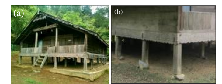
Fig. 1:(a). View the traditional Gayo Reje Baluntara house; (b) Cross section of foundation and column

Basic field elements consist of foundations, columns and floors. The results of identification of column shapes and foundations in gayo traditional houses are swear foundation systems. Uumpak foundation functions to hold the load of the building through a column or suyen which means a pole. Suyen is a rectangular beam with the same dimension.