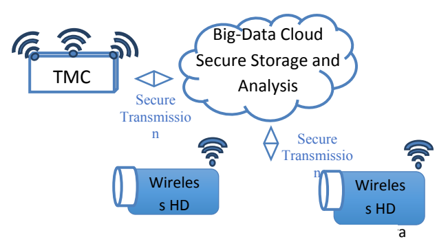
Fig. 2: Block Diagram of the Proposed System

The first step in the research would be to establish a framework for the ITS big-data acquirement which will be carried out using distributed infrastructure of sensing or monitoring nodes preferably wireless cameras, consequently the data is analyzed locally by performing pre-processing stage at each node. This amounts of processed data is then converted to another format to meet the requirements of size and security to be prepared for transmission to distributed cloud servers for storage and recovery. Accordingly, the cloud servers holding the stored data (Sridhar KP, et al., 2018) provides many services including analysis, manipulation and retrieval of this data at high speeds or in real-time which can be accessed from local site or traffic management centers TMC's. Figure-1 below demonstrates the block diagram of the proposed system.