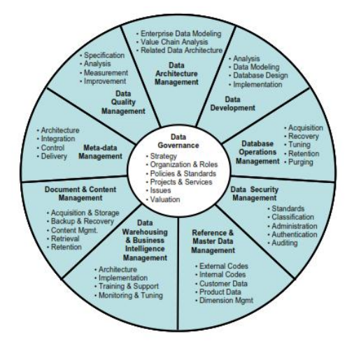
Fig 1: Data Governance Framework DAMA International

In Figure 1, the model shows that the function of data governance is at the core. As for the ten (10) in the data management function DAMA International is as follows: