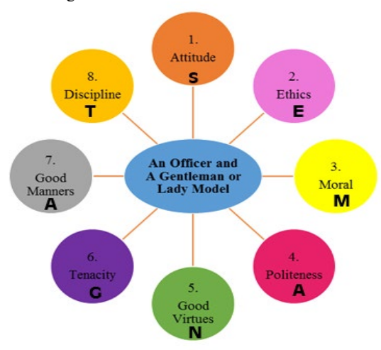
Fig.1: An Officer and Gentleman or Lady Model Based on 8 Elements

mould students into an officer and a gentleman or lady. An officer and a gentleman or lady model to be embraced by UPNM students is based on eight elements that form a Malay word "SEMANGAT" is shown in the Figure 1.