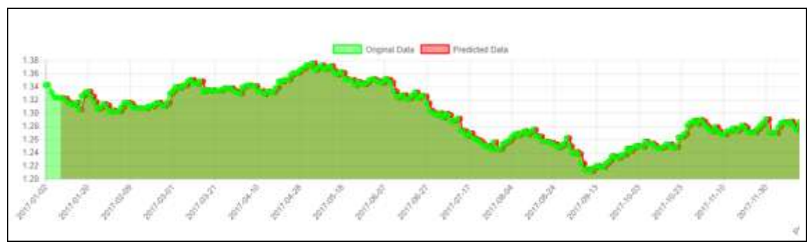
Fig. 6: Forecasting results for USD/CAD