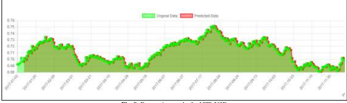
Fig. 8: Forecasting results for NZD/USD