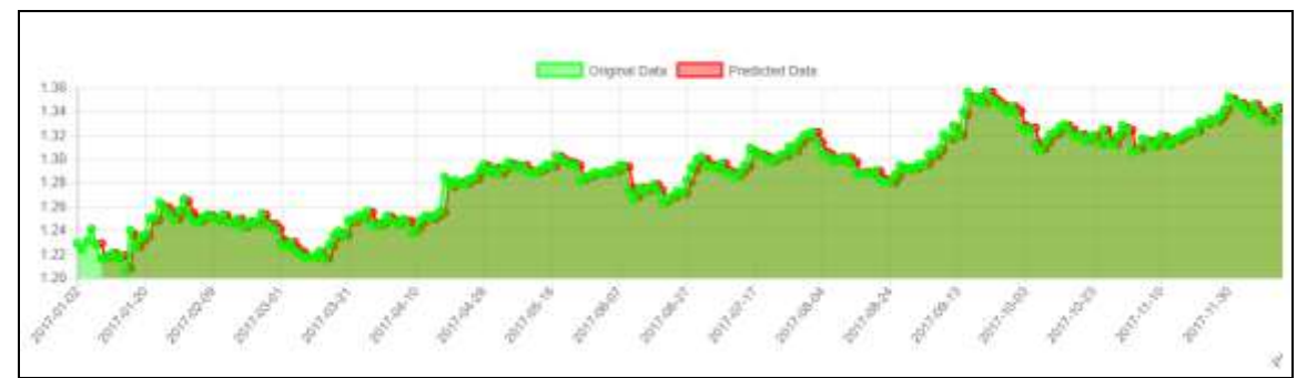
Fig. 4: Forecasting results for GBP/USD