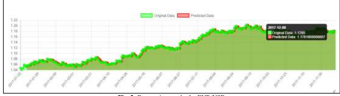
Fig. 2: Forecasting results for EUR/USD

A web based application called Phatsa is also used in this study to do the calculation and graph the forecasting results of each currency pairs. Phatsa is a free to use web application with the main purpose to help researchers and practitioners forecasting future values of any time series data [23] and can be accessed on http://phatsa.com [24]. Interested readers are encouraged to read Ref.[25] to get more information on Phatsa.