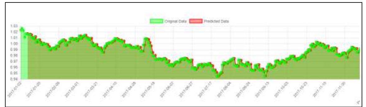
Fig. 5: Forecasting results for USD/CHF