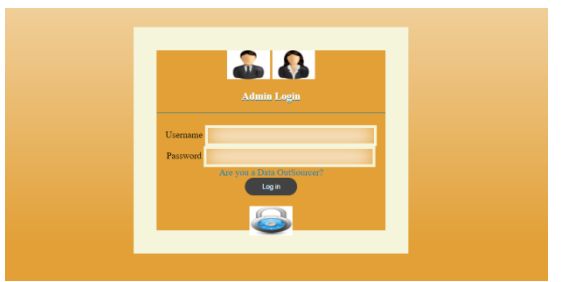
MODULE 2: Information Proprietor

Information Proprietor is a man who will store the records in cloud which thusly got to by the approved Information Shoppers. Information Proprietors resemble Liberian who will transfer every one of the records in the framework. At whatever point the document is transferred it will be scrambled by the framework utilizing Information Proprietors Encryption Key (Two Layer Encryption). Information Proprietor needs to determine the Entrance Approach for every single record. Access approaches are set utilizing Space Quality and Sub-Area Trait.