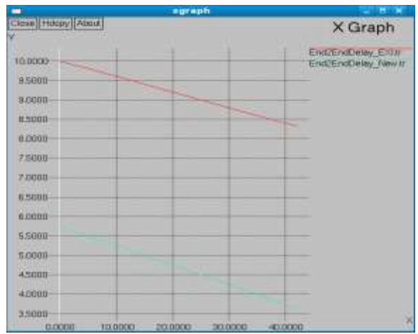
Figure 1:. Network performance: end-to-end delay

This metrics calculates the total number of packets delivered per second, means the quantity number of messages which are delivered per second. The network throughput (in bps) of the proposed scheme under different network scenarios is provided in Fig. 2. Note that the simulation time as 35s, which is considered as the total time. The throughput values increases with increase in time, and after some time interval it shows steady improvement.