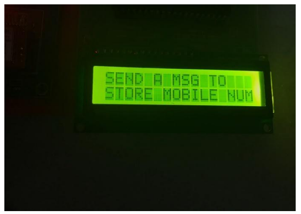
Figure 4:-Mobile number Registered