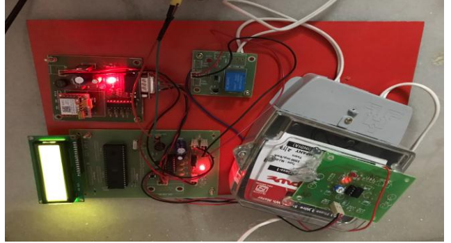
Figure 1: - Experimental setup for proposed design