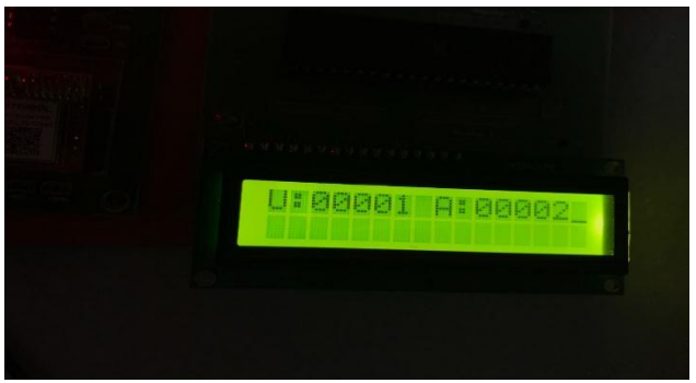
Figure 5:-Amount and Units Consumed

This is our structure were smart power meter is related with the little scale controller one side and afterward again it is related with the essential supply. Here in the controller we form a code for recuperating the data from the smart power meter. From little scale controller we interface it to ADC which changes over basic data to the propelled data and negative behavior pattern versa, from here the data is given to the MAX 232 and RS232 which are used as interfacing unit between smart power meter and the GSM network [6]. RS232 is a connector which is used to transmit the electric signs between the system and modem. As per the code written in the littler scale controller, SMS is sent to the smart power Provider Company. At whatever point SMS is sent to the smart power Provider Company then customer is given a prepared alert which moreover reminds customer about the charge. This is for the customer flexibility here we too give LCD Display. This helps the customer for affirming the data when SMS is sent to the smart power Supplier Company. This decreases bungles done by the masters in the midst of taking the smart power meter perusing.