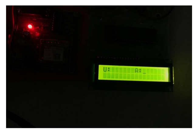
Figure 3:- Send a message to Registered Mobile