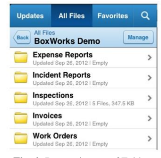
Fig. 4: Demo pictures of Folders

To duplicate and glue a specific organizer, we can utilize the route strategy. The client can see and center the specific envelope that he needs to duplicate and hold up till its shading changes (This shading change is to confirm the required organizer). What's more, when the required phase of the organizer is gotten , we can choose i.e., can duplicate it by moving your eyeball to either side of the portable on a level plane.