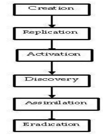
Fig. 2: Life Cycle of Computer Virus