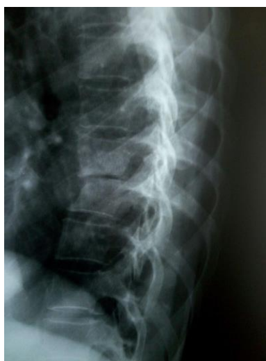
Fig. 2: Skiagram of Dorsolumbar Spine- Lateral View Showing Loss of Intervertebral Disc Space at the Level of D8-D9.