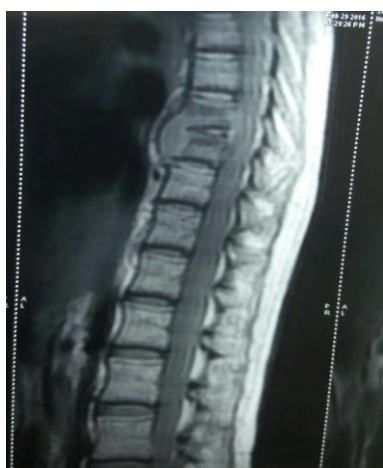
Fig. 3A: T1W1 Weighted MRI Image Sagittal View of Dorsolumbar Spine Showing Destruction of Vertebral Body and Granulation Tissue at D8-9 Vertebral Body.