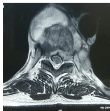
Fig. 3C: T2 Weighted Image of MRI Dorsolumbar Spine Axial View Reflecting Destruction of Vertebral Body and Hyperintense Granulation Tissue in Epidural Space and Anterior to Vertebral Body.