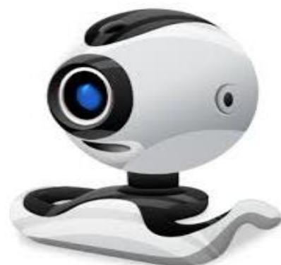
Fig. 3: Web Camera.

The webcam is interfaced with the person computer or computer network. It captures the images in real time and automatically saves it. After that it can be sent to various networks via internet or an email attachment. Usually the web cam is connected to a PC or any other device through USB cable. In laptop it comes as built in device. The webcam means which connected to the internet or web continuously and send original scene to any one in real time. In this smart home base security system, the web cam captures the guest images when the bell rings and send to the client through Email.