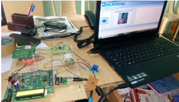
Fig. 6: Screenshot of Email Alert on Internet Browser - Result 2.