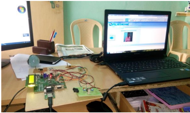
Fig. 5: Screenshot of Email Alert on Internet Browser - Result 1.