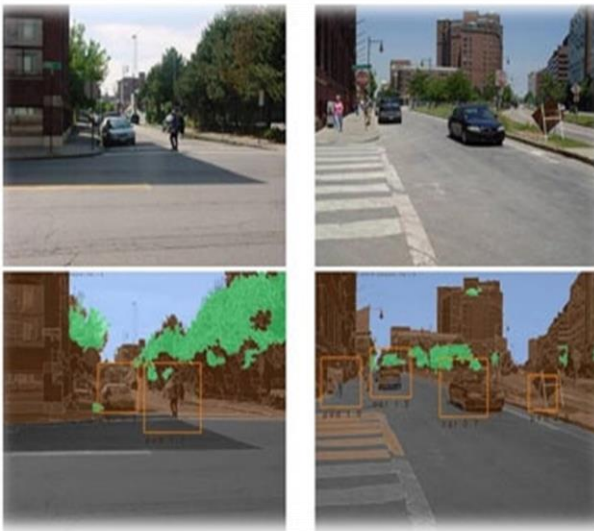
Fig. 1: Understanding with biological feature

For object recognition takes as information the unlabelled pictures of advanced photos from the road scene database (top) and produces programmed comments (base line). The orange bounding boxes are for people on foot ("ped") and autos ("auto"). The framework would have likewise recognized bikes if show. For sky, structures, trees and street, the framework utilizes shading coding (blue, dark colored, green and dim). Note the false location in the picture on the right. A development sign was mixed up for a pedestrian.