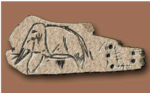
Figure 1: Mammoth bone tiara depicting a mammoth grazing in the tundra, Paleolithic site p. Malta, Irkutsk region. Storage State Hermitage [3].

Thus, a mammoth grazing among the grassy tundra (fig. 1) is depicted on a bone diadem stored in the Hermitage from the Maltinskaya site near Irkutsk. This headpiece is hardly one of the first jewelry, whose age is estimated at approximately 24 thousand years [3]. The landscape, carved on a bone plate, of course, is conditional, as is the image of a grazing mammoth, nevertheless, it is a landscape that gives an idea of time (the ice age) and the place (tundra with sparse vegetation).