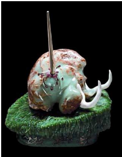
Figure 5: Workshops by Natalia Bakut and Dmitry Korshenboim, 2008, jewel-stone carving composition "Ice Age". Jade, gold, silver. Private collection [4].

Not a few jewelry works by Arkady and Natalia Lodyanov, made in jade and other colored stones, are landscape miniatures. However, first of all, they should include an absolutely unusual for the artistic merit of the jewelry-stone-cutting composition "Beginning", which is stored in the funds of the Irkutsk Regional Art Museum (IOCM). The work was solved in a cubist manner of black and green jade: a jumble of black, semi-translucent jade blocks, torn by cracks, through which elastic shoots make their way, resembling the sails of ships huddled together in the harbor, ready to go to an unknown world (Fig.6).