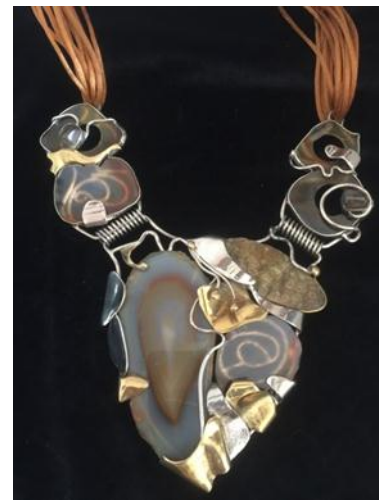
Figure 4: Elena Goncharova, 2015, necklace "At the frozen lake". Agates, bronze, cast, jewelry cord. Property of the author.

Often, this is an autumn landscape in bronze products with a bright cornerstone of berries bearing the first frost. Sometimes in her landscape compositions the artist uses Siberian gently colored agates with drawings resembling water frozen in the cold. Such a stone was used by Elena Goncharova for the necklace "At the Frozen Lake" (Fig. 4). Agate made frost stuck on the surface of the reservoir, in which frozen algae curled up with fancy rings under ice, overwhelmed yellow leaves and fallen sprigs of berries froze on the surface of the ice, frosting imitated with a quartz brush.