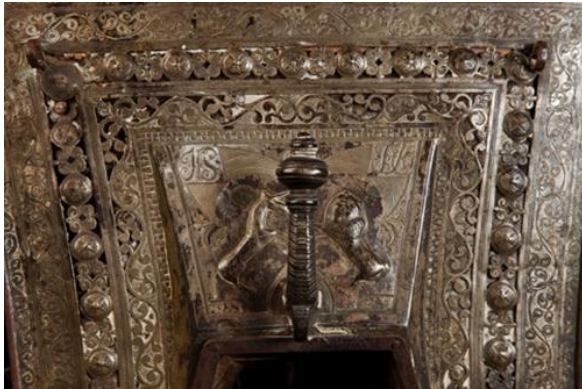
Figure 3: Buryat ethnic product - a wooden baby saddle decorated with jewelry plates. The first third of the XIX century. Silver casting, chasing, engraving, blackening, etching. The storage place of the Irkutsk Regional Museum. Photo by R.M. Lobatskoy, A.D. Knyazev [4].

In the jewelry decoration of the Siberian shaman's costume and personal festive ethnic jewelry, decorated for each kind in a special absolutely recognizable artistic style, plants are almost always present. Usually they are not decorated in a landscape in the usual sense for us, but upon closer inspection, the decor of all products without exception reminds of the Siberian steppe landscape with delicate intertwining stems of delicate herbs and inconspicuous inflorescences.