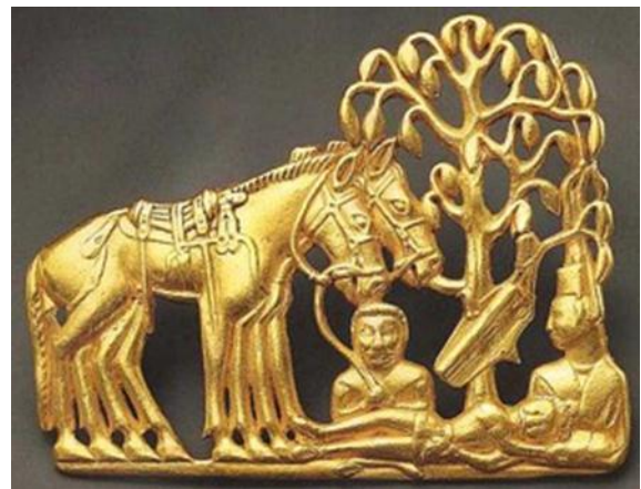
Figure 2: Scythian belt plate "Rest on the Way", V-IVvv BC Gold cast. Storage State Hermitage, Peter collection.

The product draws attention to the technique of execution, which is generally characteristic of the jewelry art of the time: horse grains are molded and decorated to the fullest detail, on which you can distinguish the smallest details of harness, well-groomed, braided manes and tails, one of which is twisted into a braid, the other into a knot. Human figures are quite clearly read. The bearded faces of the men sitting and lying, the calm face of the woman, their clothes and hairstyles are clearly distinguishable. One of the travelers is sleeping with her head resting on the knees of a woman sitting next to her, dressed in a robe with wide sleeves, the other is holding the reins of horses [9-10].