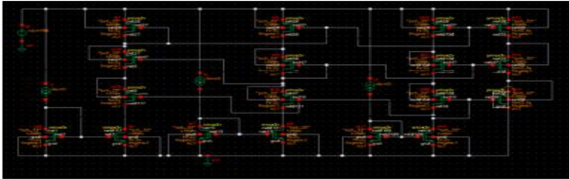
Figure 2: Three inputs MIN circuit.

For inputs for example three-input MAX circuit are as shown in Figure below. Diseases (mean age 47.1 \pm 10.2 ) as controls.