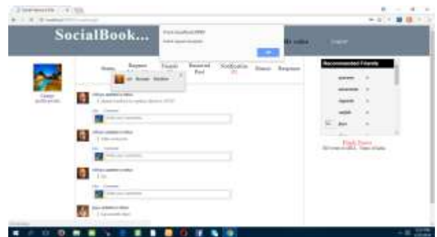
Fig 7.5: Accept friend request

The user update the status .They sends status to others other friends.