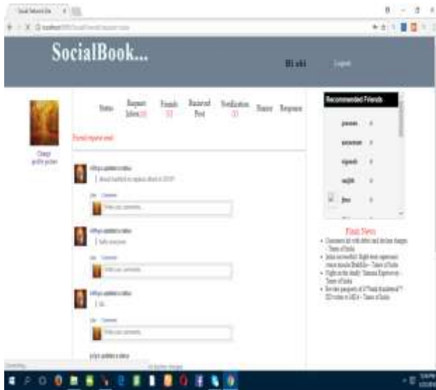
Fig7. 6: Acknowledgement

They send acknowledgment to other friends. They accept acknowledgement from others.