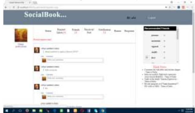
Fig 7.4: status update

The user sends the friend request to others. They make the friends.