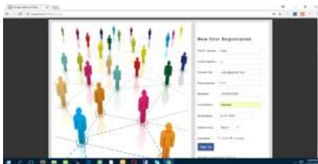
Fig 7.1: user registration

The user creates the registration page. The registration is created.