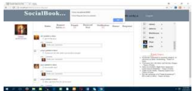
Fig 7.3: sending friend request

The profile is updated in the page. Each user assigns the profile picture.