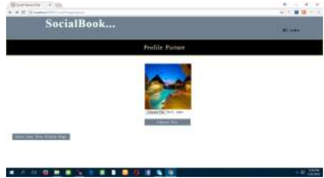
Fig 7.2: user profile

The user creates the registration page. The registration is created.