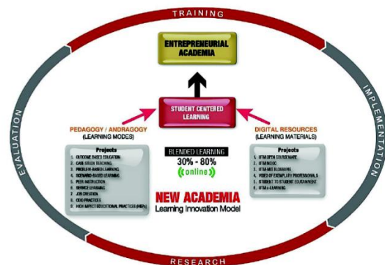
Fig. 1: New Academia Learning Innovation (NALI) Model (2)

The use of online learning resources in teaching and learning is part of the blended learning program in the New Academia Learning Innovation (NALI) Model promoted via the top-down approach by the management of the university. NALI is part of teaching and learning policy of the university. The objective of NALI is to create meaningful and interactive learning activities, materials, environments and systems appropriate to develop Graduate Student Attributes (1). NALI Model emphasizes pedagogy and the use of digital resources as shown in Figure 1. Examples of pedagogy (also known as Learning Modes) are case study teaching, problem-based learning, peer instruction, and service learning; whereas examples of digital resources (also known as Learning Materials) are Open Courseware (OCW), Massive Open Online Courses (MOOC), and BLOSSOMS. However, this paper only discusses the academic staff's awareness and implementation of online learning resources (or digital resources) in their teaching.