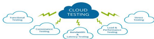
Fig. 3: Cloud based testing

It checks the nature of a cloud from an inside view in light of the interior foundations of a cloud and determined cloud proficiencies. Just cloud sellers can execute this sort of testing since they have access to inside foundations and associations between its inner SaaS and programmed proficiencies, security, administration and screen[16].