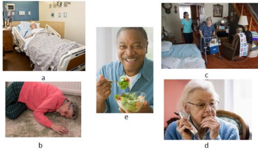
Fig. 2: Selection of categories where (a) represent sleeping, (b) fall detection, (c) walking, (d) talking on phone and (e) eating

system is trained to predict the actions of a human in a particular position, It will tend to recognize actions correctly is it is performed in such a manner or else it will predict some other result to emerge out as output. There are certain actions that are to be monitored for the elderly and physically challenged people. The purpose is to know whether they are able to live their routine life without any trouble. There is no need for these kinds of people to stick to only one location. They will certainly go over the house if they want something or to perform certain tasks. Therefore, the smart systems used for monitoring shouldn't be used in only their room but it should also be used in living room, dining hall and various other places where the human activities can be more. The activities that are to be monitored for such kinds of people are whether they are sleeping, eating, walking, fall detection and talking on a phone.