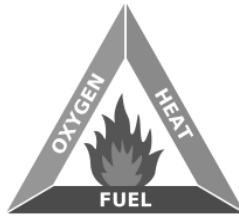
Figure 1: Triangle of fire

Construction sites tend to have a potential abundance of all three components of the fire triangle as shown in Figure 1. Typical sources of heat on construction sites include soldering or blazing of pipes, grinding, welding, smoking, lead work, temporary heaters, combustion engines, temporary electrical supplies, lights, etc. Typical sources of combustible material include gas bottles, waste, diesel, petrol, fuel-driven plant, etc [5]. Oxygen is ever present but is also enhanced through oxidising agents and oxygen bottles.