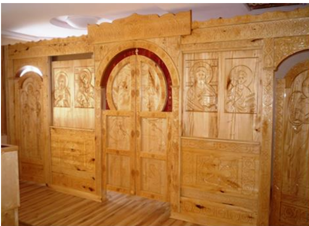
Fig. 1. The iconostasis for the blind and visually impaired children

The project of the iconostasis is fully realized. The aim of the carved iconostasis is the spiritual and moral perception of blind children through the tactile sense of church culture. Deep assimilation of the Orthodox tradition is carried out through the relief of icons, symbols, ornaments, healing prayers and the development of artistic and creative reflection of blind and visually impaired pupils (fig. 1).