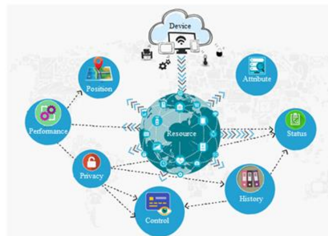
Figure 2: the proposed ontology-based resource description model

Based on the above-presented analyses, the present article posits seven classification attributes, including status, control, characteristics, history, privacy, performance and position that are used for the description of resources' information of an IoT. Amongst them, the position information is mostly composed of the recorded information pertaining to the device place and time. Performance information, as well, elicits feedback from the control source in respect to the information obtained from the status, position and history of the device. The ontology-based resource description model has been displayed in figure (2).