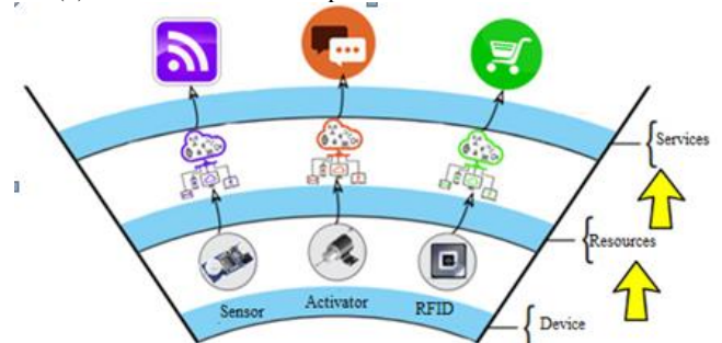
Figure 1: abstract process in IoT devices

A device in IoT needs to be recognized as an authentic source through a series of abstract processes. The way a device characterized by various attributes is described is considered as a key and essential issue. The present article proposes an ontological theory to make a resource description model for IoT; the model can perceive and identify the integrated semantic descriptions of different heterogeneous devices in IoT. Based thereon, various types of resource-based services can be attained in application layer. Figure (1) illustrates the abstract process in IoT.