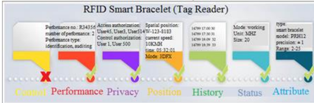
Figure 4: the explanations of the precise resources for an RID tag-reader sensor

model, precision, range and response time for every attribute class. The explanations pertinent to the precise resources required for a smart bracelet have been illustrated in figure (4).